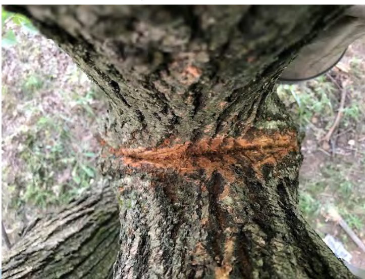
The dark included bark was pruned away. It was deep in the middle, so the pruning was not thorough.