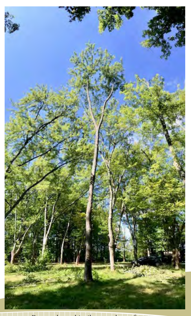
Regrowth on this silver maple conforms to the natural growth habit.