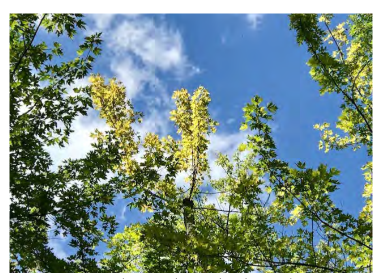
Regrowth is struggling on this silver maple; was 4" an unkind cut?