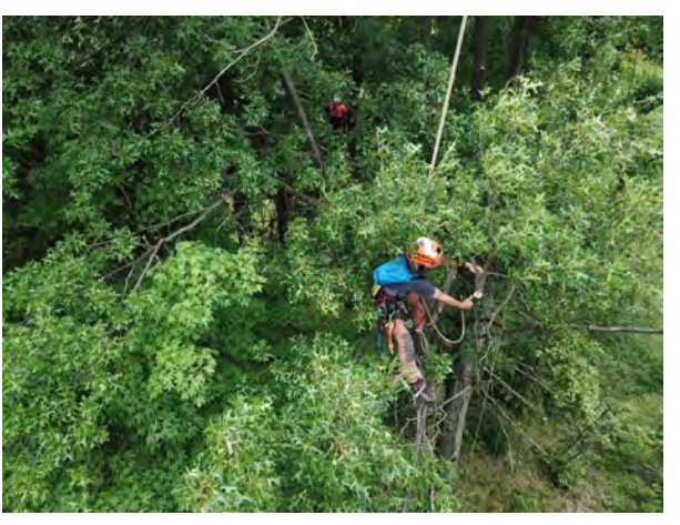
Reduction of pin oak captured by drone.