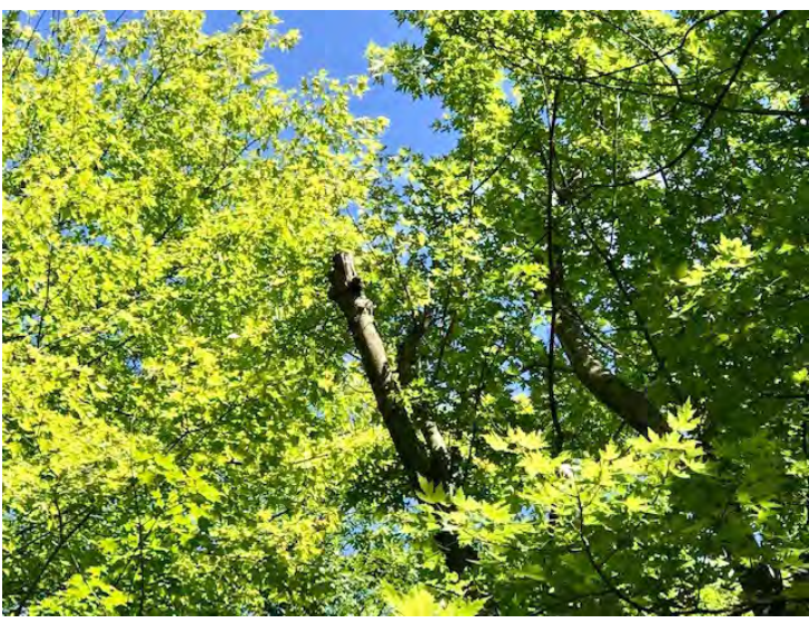
This silver maple trunk was reduced to buds. No sprouting yet; we'll check back in 2022