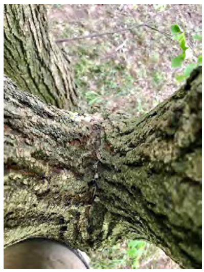
This fork has included bark from end to end; a candidate for correction!